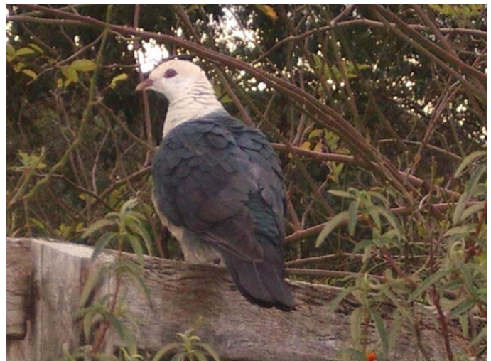
White-headed Pigeon, Wiseleigh, 5 May 2006. Now a regular on the East Gippsland bird list?.