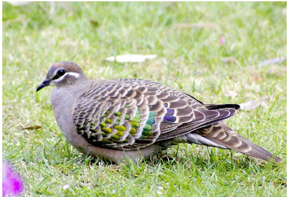
Common Bronzewing.

Then there is sunbathing. Patches of the memorial garden are covered in small peb-