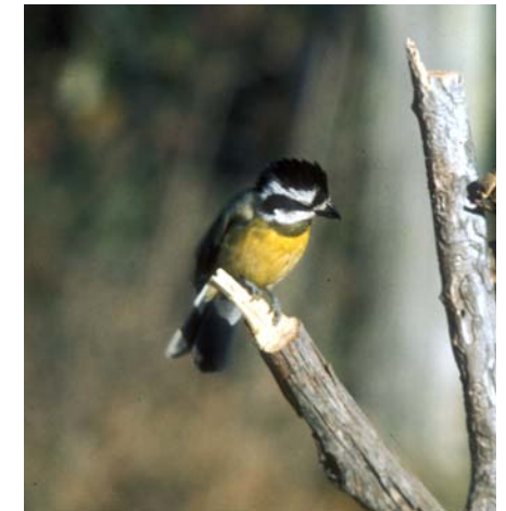
Crested Shrike-tit - J. Marshal

Guide No. 6 in a series of guides prepared by the East Gippsland Bird Observers Club