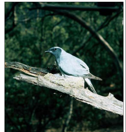
Black-faced Cuckoo-shrike - David Hollands

Guide No. 5 in a series of guides prepared by the East Gippsland Bird Observers Club