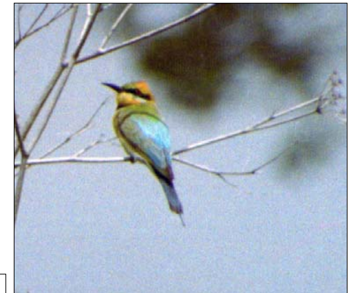
Rainbow Bee-eater - Ron Mackenzie

Guide No. 3 in a series of guides prepared by the East Gippsland Bird Observers Club