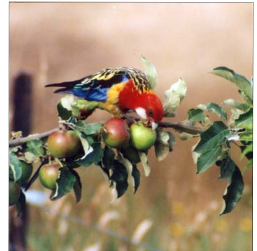
Eastern Rosella - Ken Sherring

Guide No. 1 in a series of guides prepared by the East Gippsland Bird Observers Club