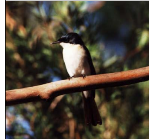
Restless Flycatcher – Ken Sherring

Guide No. 13 in a series of guides prepared by the East Gippsland Bird Observers Club