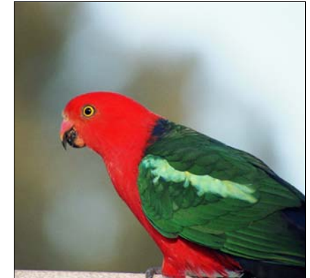
Australian King Parrot - Ron Mackenzie

Guide No. 11 in a series of guides prepared by the East Gippsland Bird Observers Club