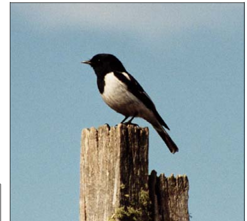
Hooded Robin - Ron Mackenzie

Guide No. 10 in a series of guides prepared by the East Gippsland Bird Observers Club